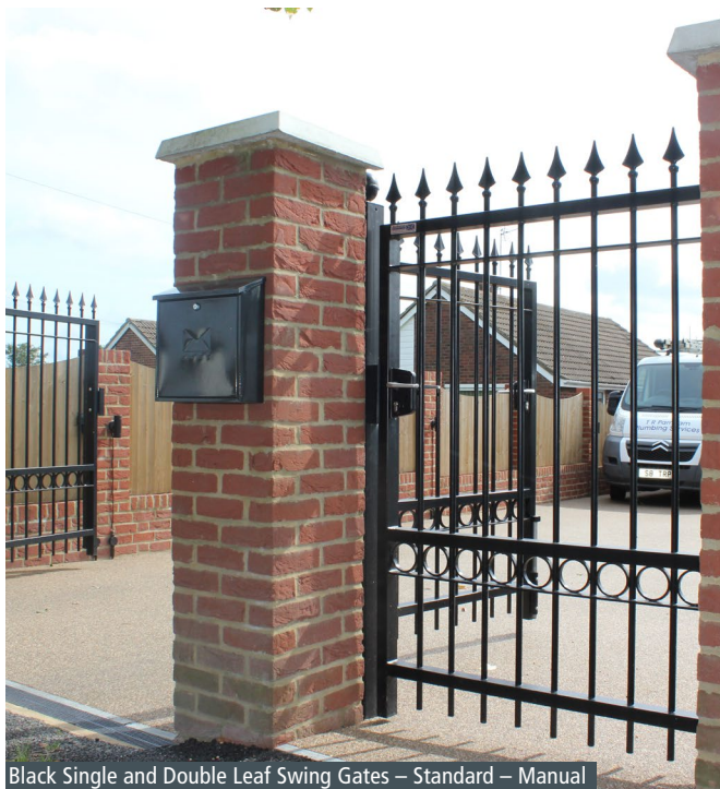
Black Single and Double Leaf Swing Gates – Standard – Manual