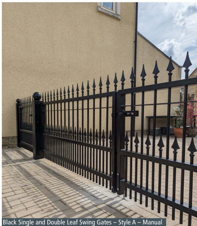
Black Single and Double Leaf Swing Gates – Style A – Manual

Ornamental swing gates complement our ornamental fencing, offering a modern tubular steel alternative to wrought iron railings in three unique styles. With welded pale-through-rail construction and a range of decorative finials, they combine classic design with advanced engineering for lasting security and elegance.