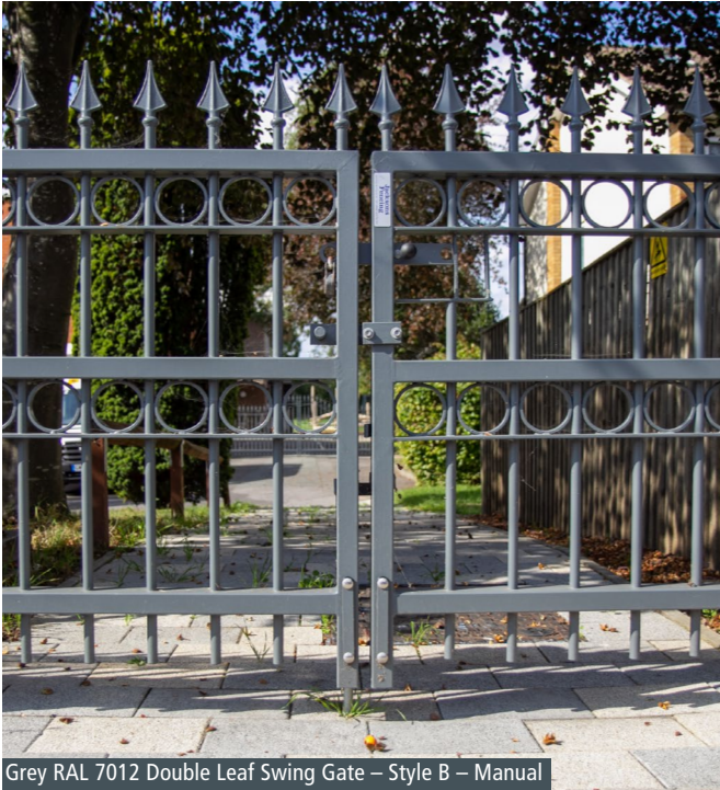
Grey RAL 7012 Double Leaf Swing Gate – Style B – Manual